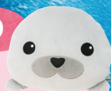
▲ Seal Cushion