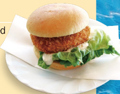
▲ Swordfish Cuttlet Burger