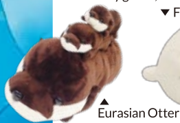
▲ Eurasian Otter