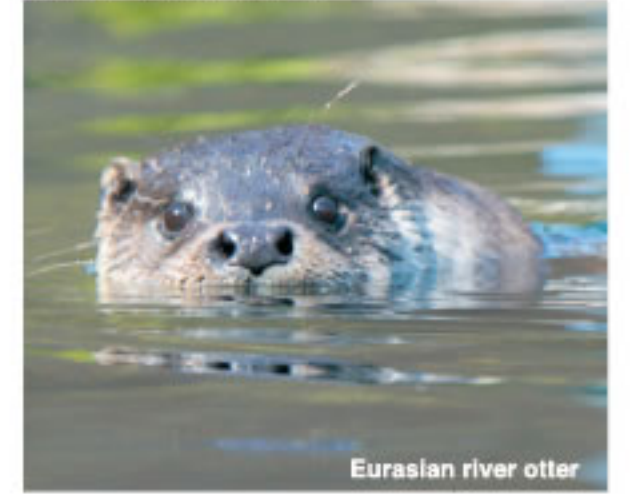
Eurasian river otter

We have recreated the natural environment utilized by the Johmon people here and are displaying Eurasian river otters as a symbol of its abundant nature.