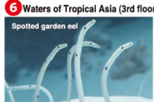
Spotted garden eel