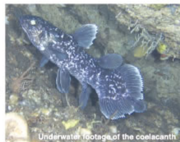
Underwater footage of the coelacanth