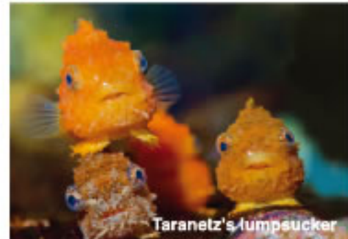
Taranez's lump sucker