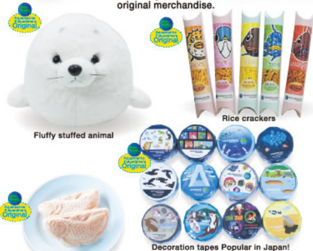
Fluffy stuffed animal

Features a line-up of fun merchandise, including Aquamarine Fukushima's own original merchandise.