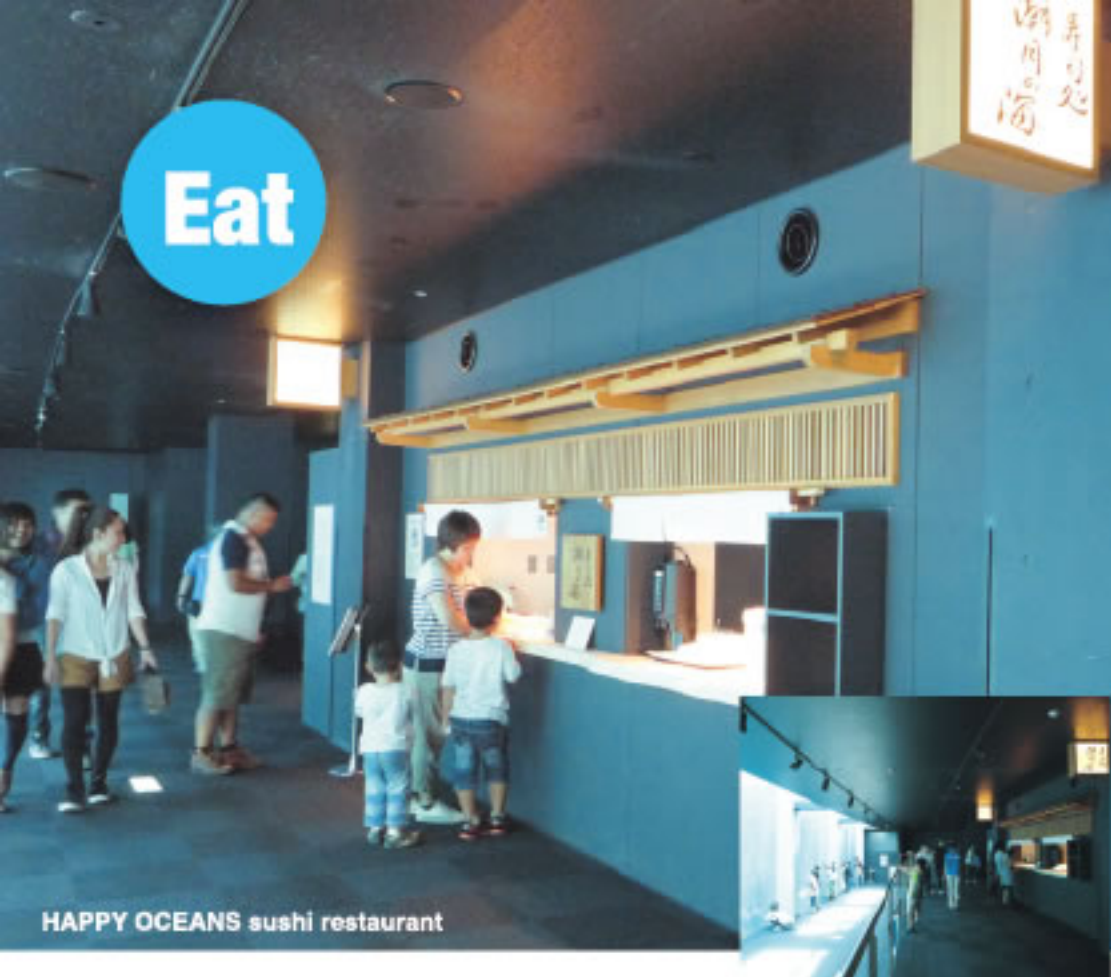
HAPPY OCEANS sushi restaurant