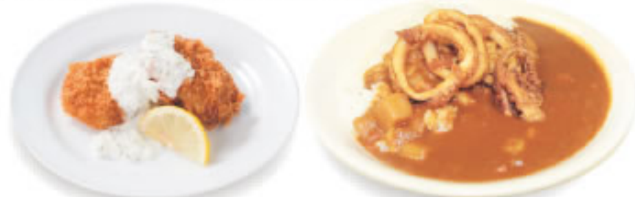
"Hemingway's kajiki menchi" (Marlin minced meat outlet)

Offers an original menu consisting mainly of seafood.