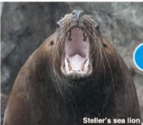
Steller's sea lion